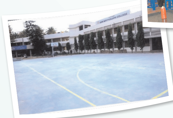
Basket Ball Court