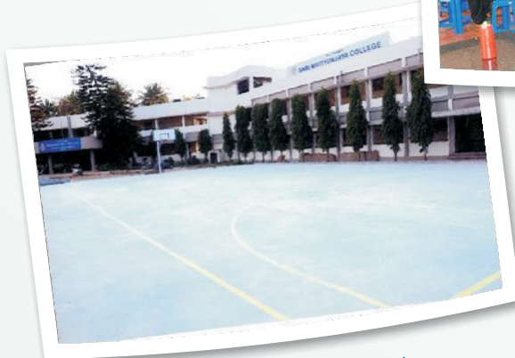
Basket Ball Court