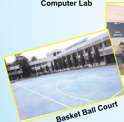
Basket Ball Court